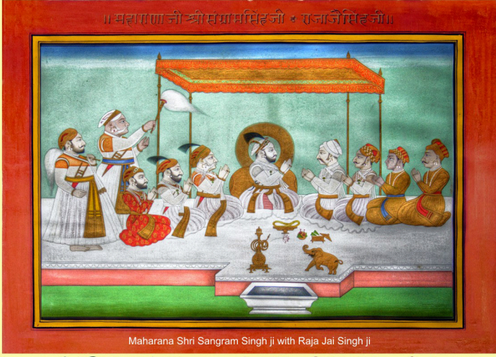
Maharana Shri Sangram Singh ji with Raja Jai Singh ji

ARVIND SINGH MEWAR 76th Custodian of the House of Mewar Chairman and Managing Trustee - Maharana Mewar Historical Publications Trust, Udaipur