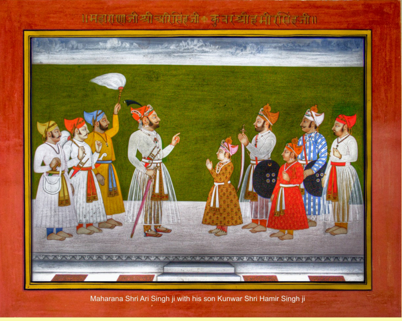
Maharana Shri Ari Singh ji with his son Kunwar Shri Hamir Singh ji